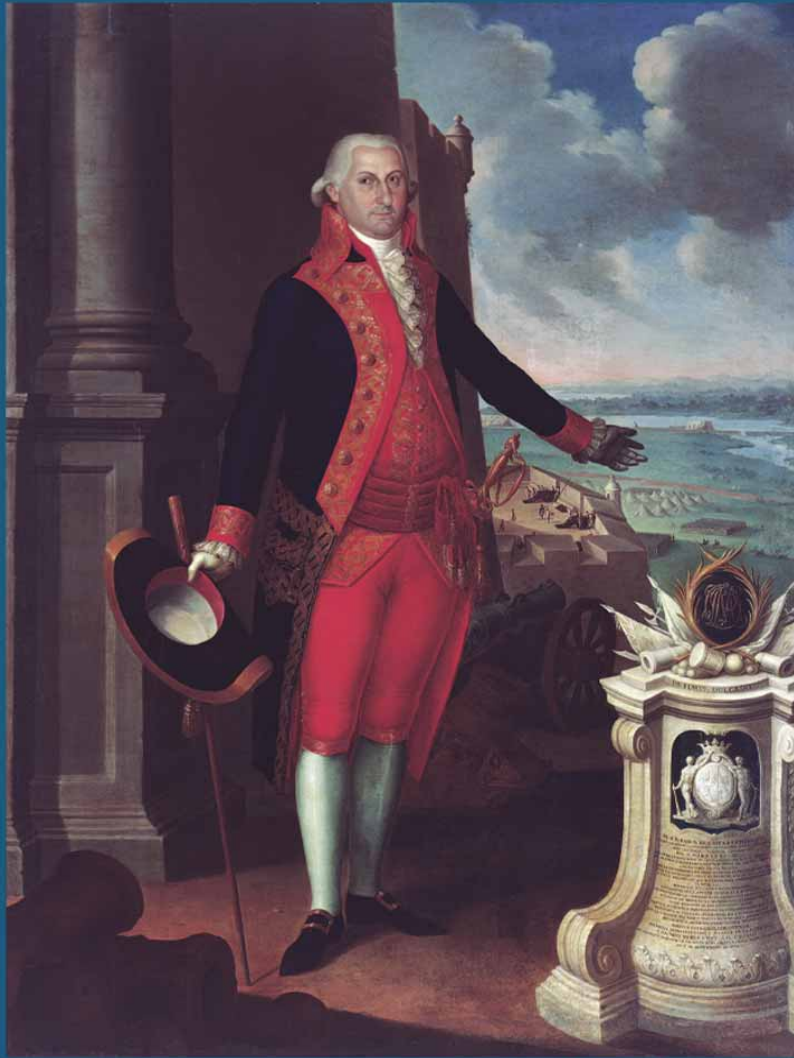
José Campeche. Gobernador Don Ramón de Castro ; óleo sobre tela.