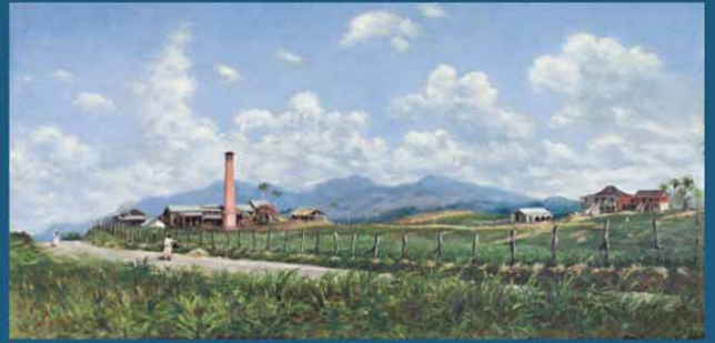
Francisco Oller. Hacienda Aurora ; óleo sobre madera. Colección Museo de Arte de Ponce. Fundación Luis A. Ferré, Inc.