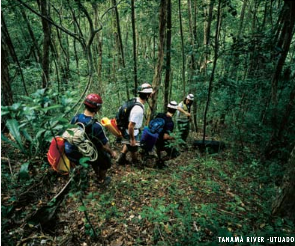
TANAMÁ RIVER -UTUADO