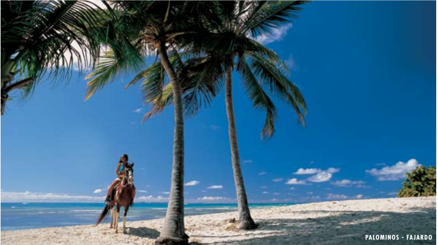
PALOMINOS - FAJARDO